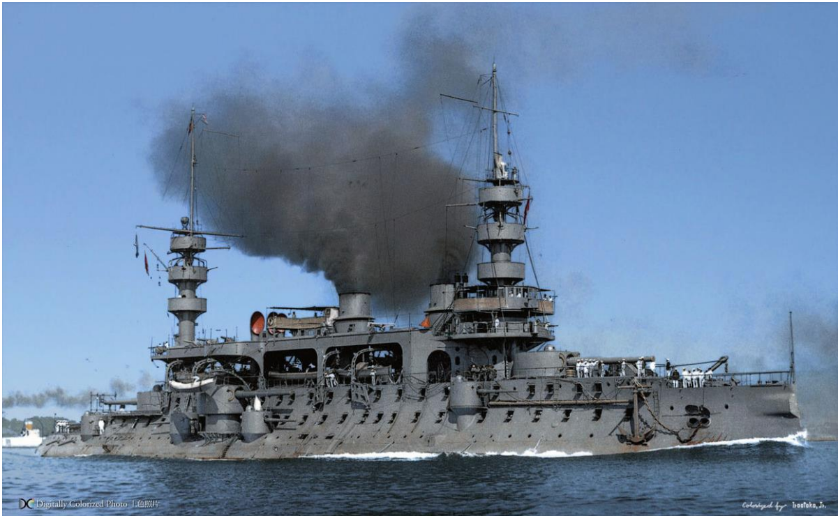
A colorized photo of the French battleship Charles Martel taken sometime before 1914.